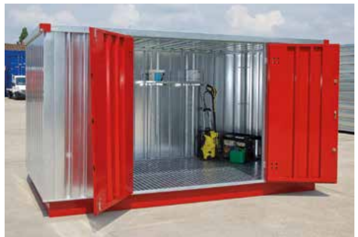
Expandachem - Flat-packed storage unit for the safe storage of chemicals and lubricants.