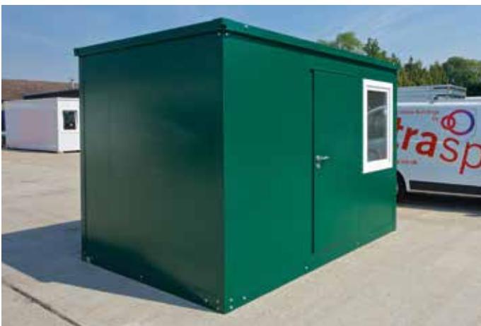
Expandakabin - Flat-packed office unit home and commercial use.