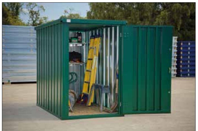
Gardenstore - Flat-packed secure storage unit for all your garden equipment.

The Expandarange of flat-packed buildings is available from: