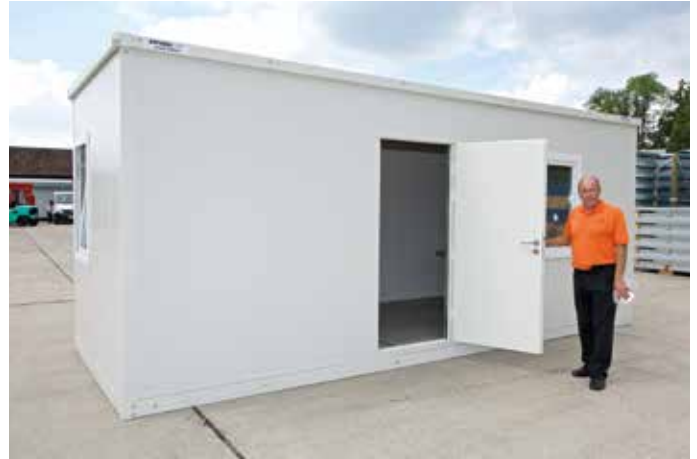
Expandacom - Flat-packed office/ accommodation unit