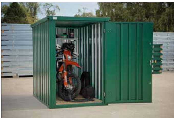
Bikestore - Flat-packed secure storage unit for cycles, motorcycles and tools.