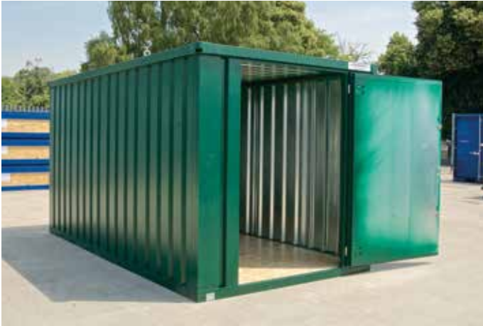
Expandastore - Flat-packed storage unit