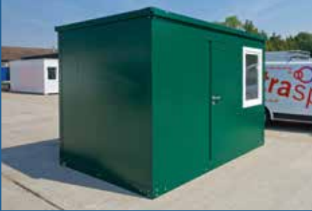
Expandakabin - Flat-packed office unit home and commercial use