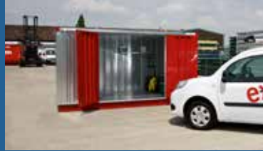
ready for use