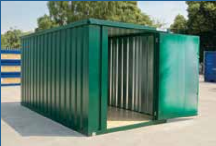
Expandastore - Flat-packed storage unit