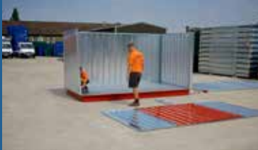
simple to assemble