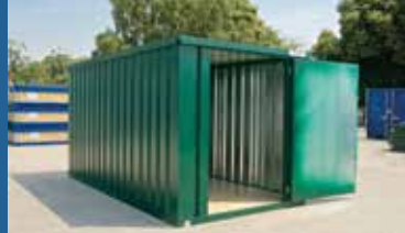
ready for use