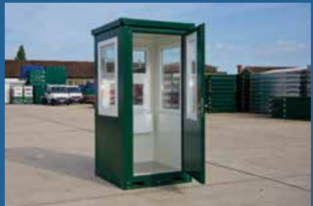
Expandakiosk - The UK's market leading insulated, man portable kiosk