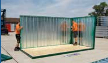
simple to assemble