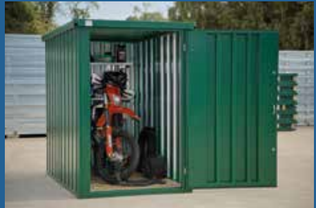
Bikestore - Flat-packed secure storage unit for cycles, motorcycles and tools