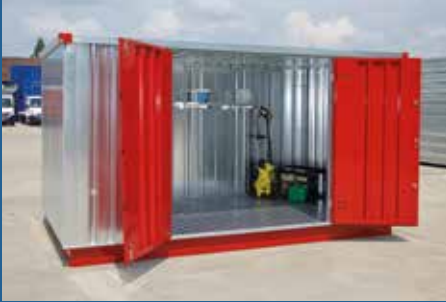
Expandachem - Flat-packed storage unit for the safe storage of chemicals and lubricants