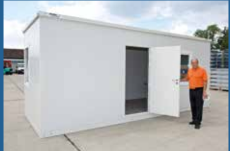
Expandacom - Flat-packed office/ accommodation unit