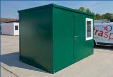
Expandakabin - Flat-packed office unit home and commercial use