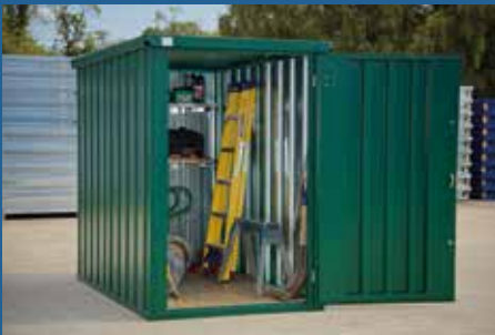
Gardenstore - Flat-packed secure storage unit for all your garden equipment